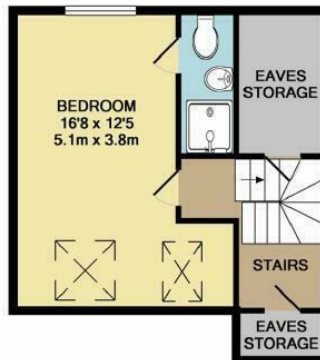
2ND FLOOR APPROX. FLOOR AREA 304 SQ.FT. (28.2 SQ.M.)

TOTAL APPROX. FLOOR AREA 1224 SQ.FT. (113.7 SQ.M.)